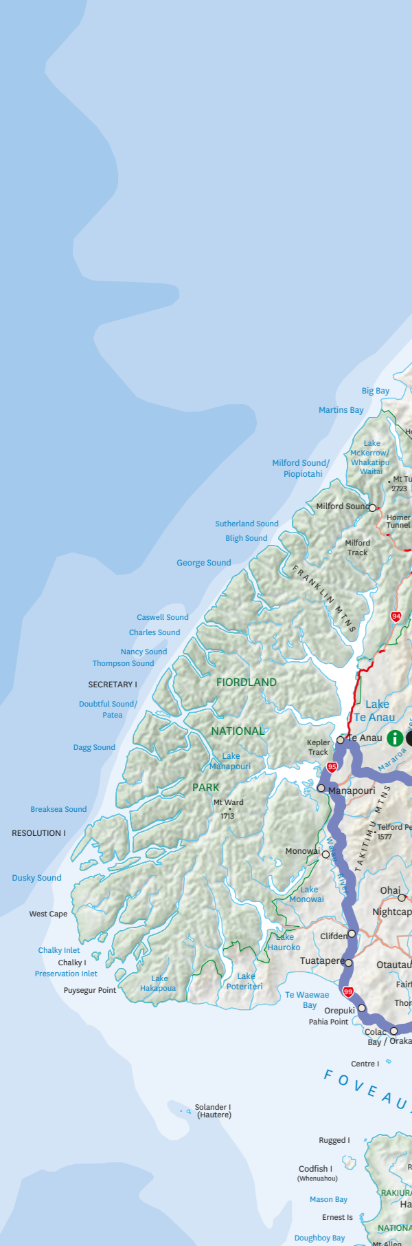
STEWART ISLAND / RAKIURA

Southern Scenic Route: Starting in the historic city of Dunedin, this route follows the wild southern coast to Invercargill, then continues west and north to Te Anau before ending at Queenstown. Highlights include wildlife encounters along the Catlins coast, the classic motors of Invercargill, cruising Fiordland, walking the Milford Track and the southern local delicacies found throughout.