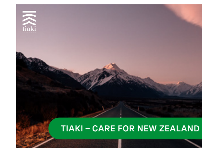
TIAKI - CARE FOR NEW ZEALAND

For more information visit www.qualmark.co.nz