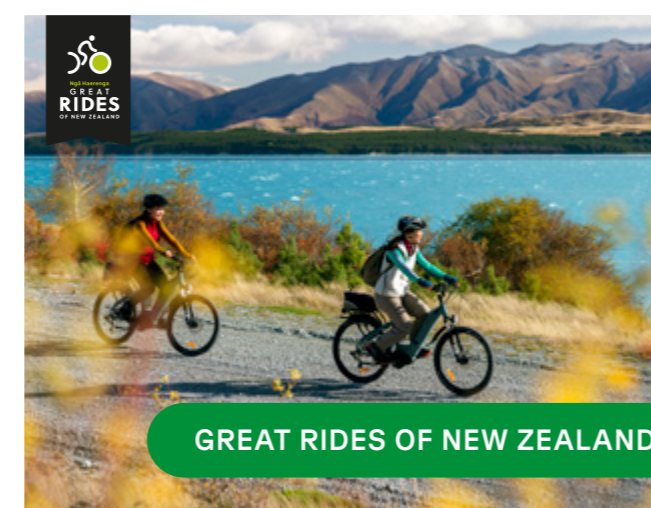
GREAT RIDES OF NEW ZEALAND

Find out where DOC visitor centres are located, opening times, and contact details to email or speak to a ranger at: www.doc.govt.nz/visitorcentres