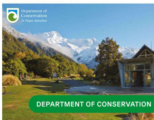
DEPARTMENT OF CONSERVATION

Find an isite near you at www.isite.nz or call 0800 474 830.