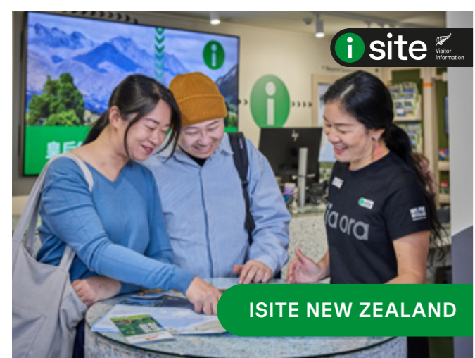
ISITE NEW ZEALAND

isite is New Zealand's official visitor information network with over 60 locations nationwide.