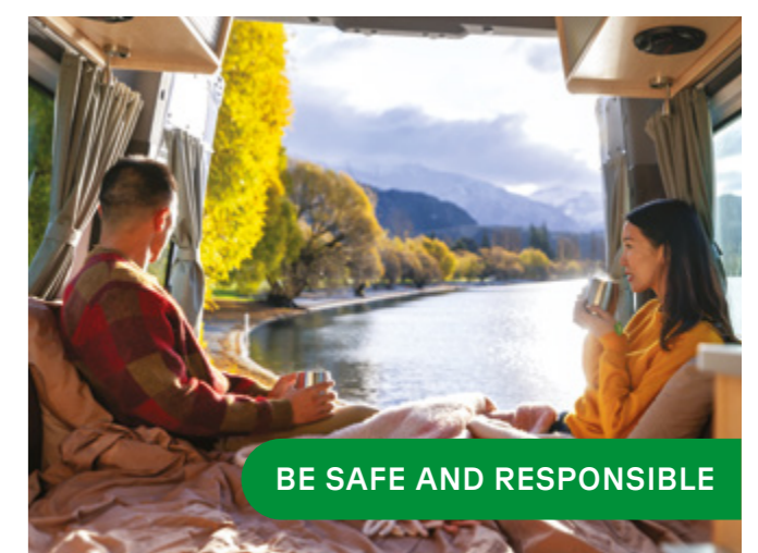
BE SAFE AND RESPONSIBLE

isite NZ has partnered with Trees That Count. Get on board and show your love for Aotearoa by planting a Forest of the Future. You can gift a tree through your nearest isite visitor information centre. For more information walk into a centre or visit www.treesthatcount.co.nz